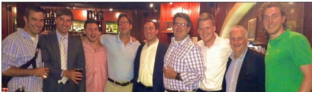
Brothers gathering for a First Tuesday in NYC.