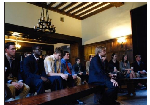
Chicago brothers during their open campus event on Sexual Assault Prevention.