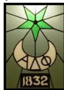
MANUS MULTAE COR UNUM

Johns Hopkins Chapter House for further socializing. A good time was had by all.