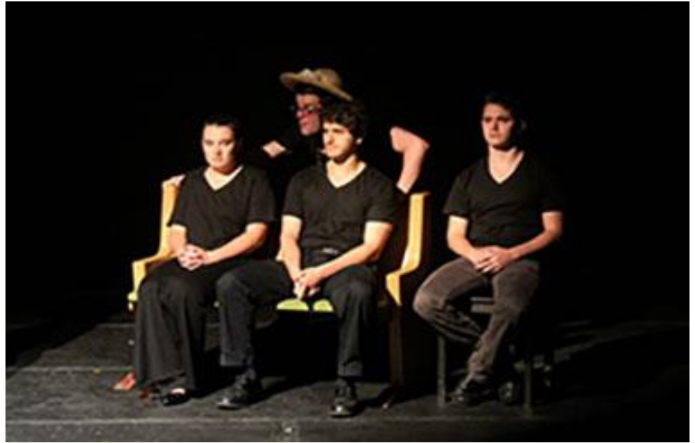
The Johns Hopkins Chapter's Literary Presentation at the 182nd Convention: Chapter members perform of Our Crowd by Thornton Wilder, Y '20

Opening ceremonies for the actual convention sessions occurred on Friday, August 1 st , with the undergraduate delegate from Hamilton leading the assembled brothers in " Xaipe ," followed by the Canadian and U.S. national anthems. The convention began on a very positive note with a unanimous vote to grant a charter to the Eliot Affiliate (now the Eliot Chapter) at Washington University at St. Louis.