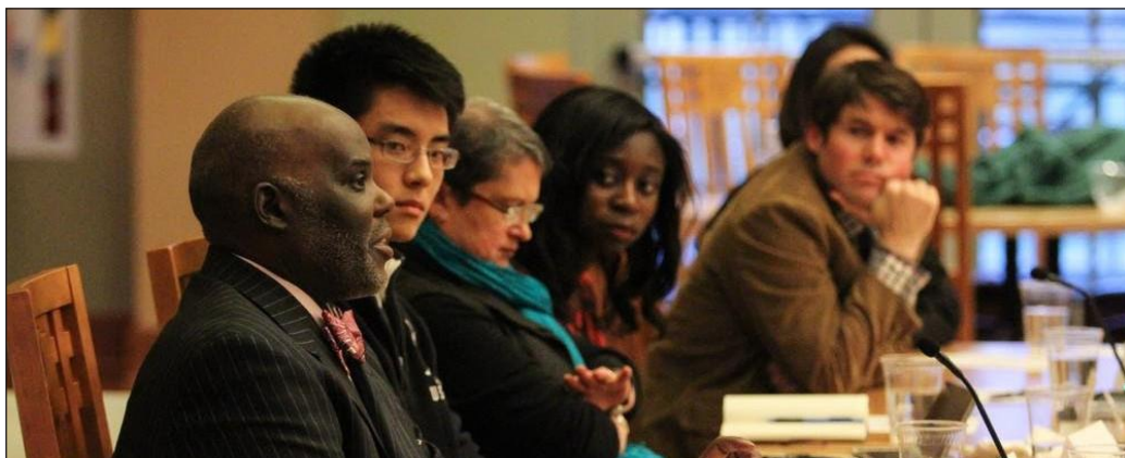
A panel of professors and students at the Eliot "Hook-up" Discussion. This Spring, the Washington University at St. Louis Student Union presented the Eliot Affiliate with its 2014 "Event of the Year" Award.

This past semester we successfully executed our first large-scale external literary event by hosting a campus-wide panel on college dating and the "hookup culture". We were met with curiosity and then acclaim for our willingness to ask the campus to engage thoughtfully and analytically about an issue that pervaded our lives. That spirit of intellectual engagement began the day we started pledging Alpha Delta Phi, and as our chapter grows, we hope to share it with our university's community-at-large and to forever entrust it to our successors. I'm confident that will keep our common tradition alive. ★