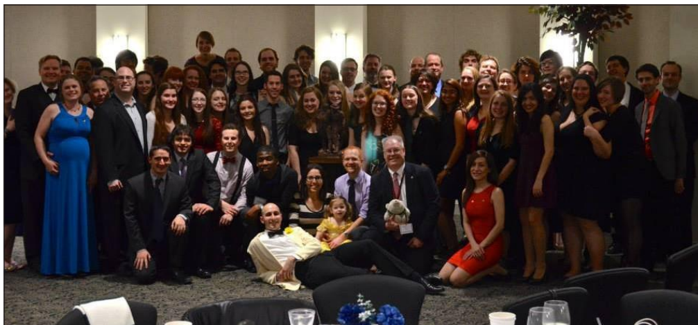
Attendees of the 2014 Alpha Delta Phi Society convention in Durham, NH.

The 44-person chapter hosts biweekly literary nights in partnership with on-campus literary organizations. Members participate in the NYC AIDS Walk, soup kitchens, Columbia Community Outreach events, and